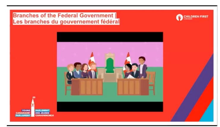
YCP Members learn about the different branches of Government and their roles in creating legislation.