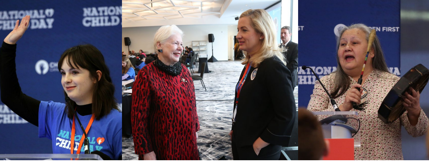
In 2019, youth and adults gathered in Ottawa to celebrate National Child Day and the 30th anniversary of the UN Convention on the Rights of the Child. The Hon. Elizabeth Dowdeswell, Lieutenant Governor of Ontario, also attended the event.